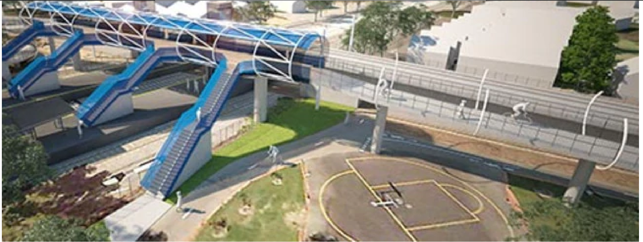
An artist's impression of the planned $10m walking and cycling bridge over Goodwood station.

A BRIDGE will be built over the train line at Goodwood to improve safety for cyclists using Adelaide's busiest bikeway.