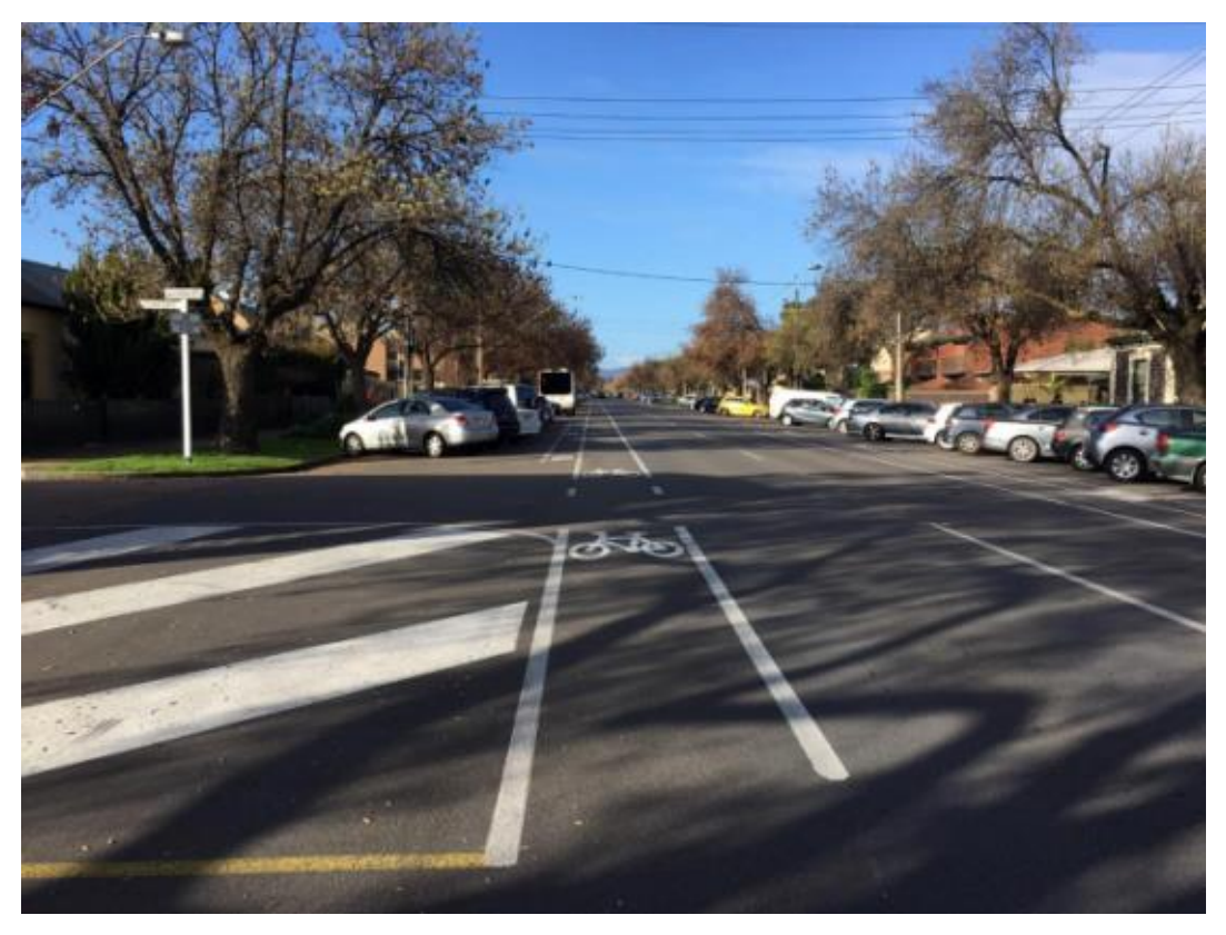
The ideal residential street is a no-through road – with pedestrian and cyclist cutthroughs at the end, of course. In such cases line marking should be kept to a minimum. Unfortunately Childers Street is not like that. The map below has the position of the two photos indicated in red.